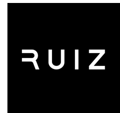
Sales Team 0424 571 645