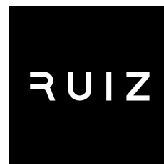
Sales Team 0424 571 645