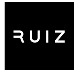
Sales Team 0424 571 645